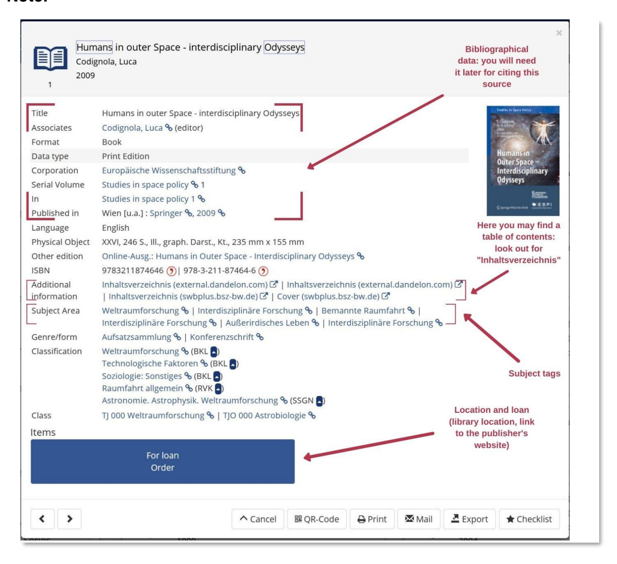
Screenshot of an entry in GöDiscovery

To quickly find this book in <u>GöDiscovery</u>, type humans odysseys into the search field. You do not need to enter the full title – the book you're looking for will appear among the first search results. This publication is an edited volume/collection , a collection of scholarly chapters written by different authors. To see the cover page and the table of contents, click the link next to "Additional information". This book is available for loan. However, it is located in an area of the library that is not freely accessible to students, so you must request it online first. To do so, you must log in with your library user number (at the back of your student card) and the library password.